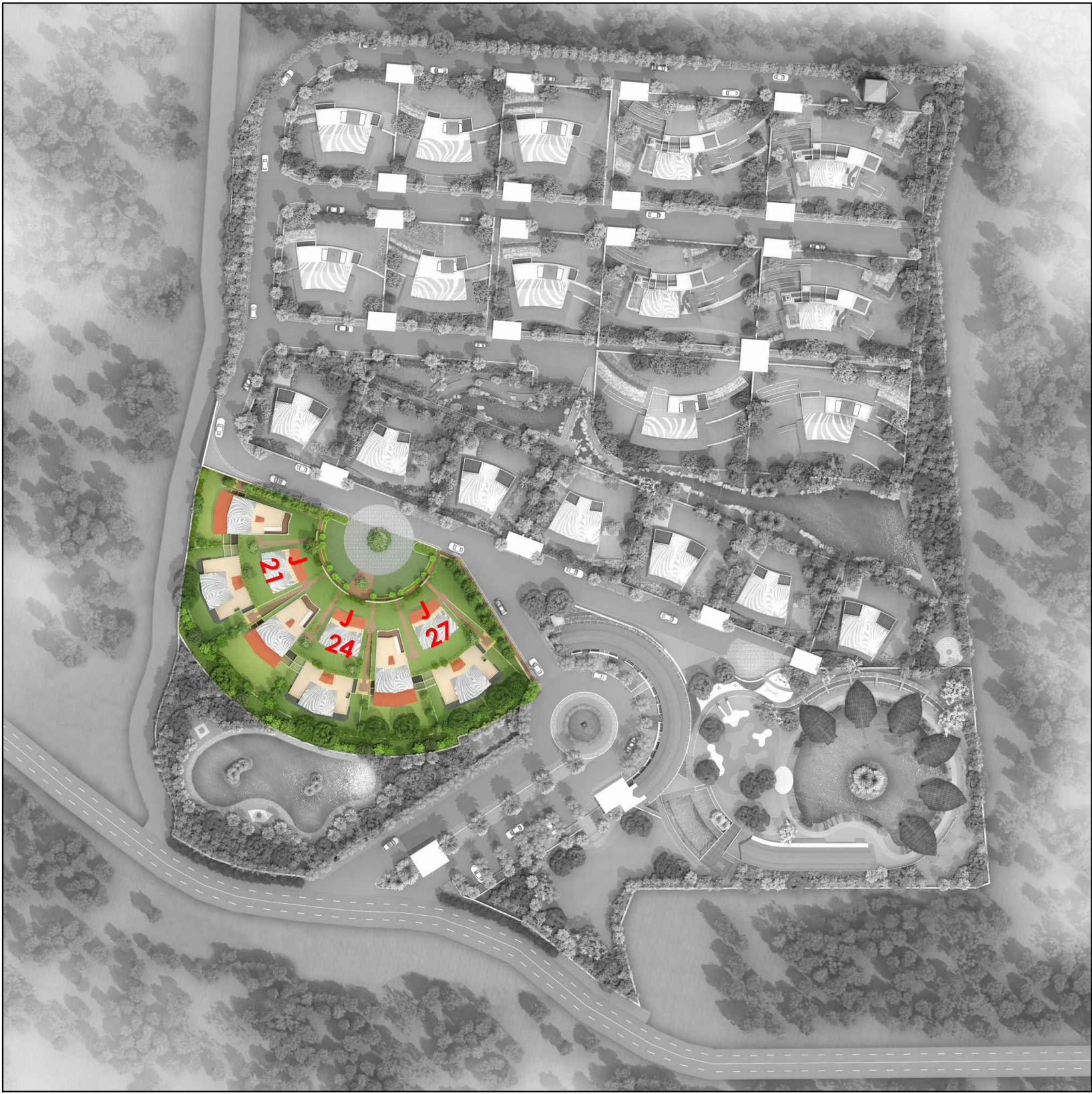
KEY PLAN PLOT NO. 21,24 & 27